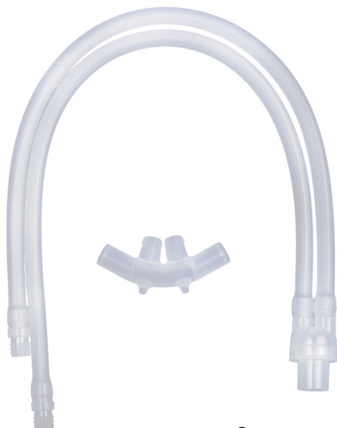
Nasal-Aire® II Frame System

Now a Nasal-Aire II interface (tubing and cannula) without headgear is available.