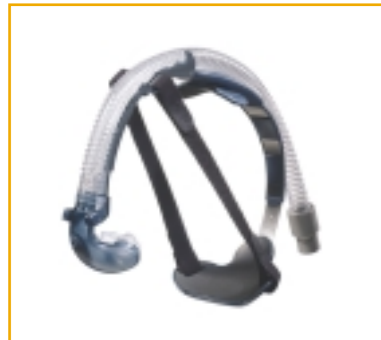
Breeze SleepGear With DreamSeal Assembly