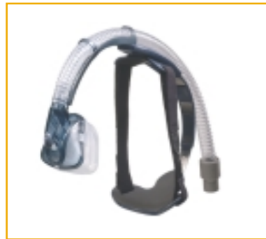
Breeze SleepGear With Nasal Pillows Assembly