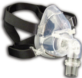
ComfortFit Full Face 100F Series