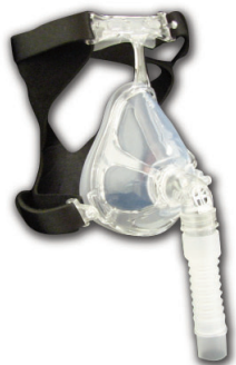
ComfortFit Full Face Deluxe+ 100FD+ Series