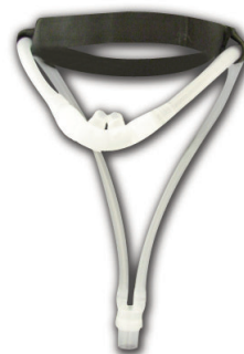
ComfortFit Cannula CS9000-A Series