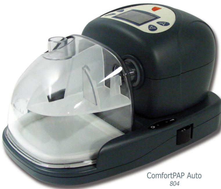
ComfortPAP Auto 804