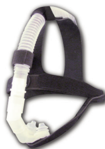
ComfortFit Pillow System VPS Series