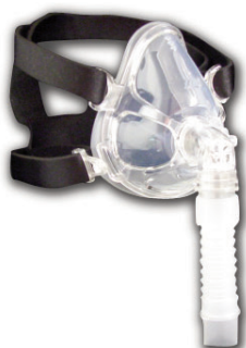
ComfortFit Full Face Deluxe 100FD Series