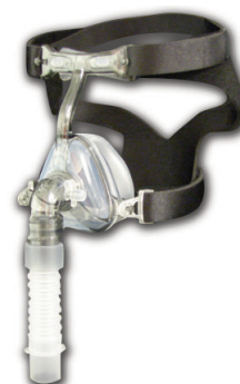
ComfortFit Nasal Deluxe+ 100ND+ Series