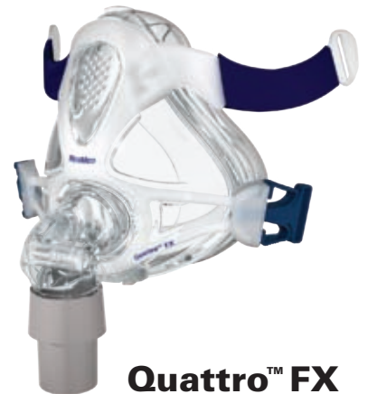
Quattro™ FX FULL FACE MASK

High-tech Spring Air cushion distributes pressure evenly and absorbs even the slightest user movements, so users can enjoy a good night's sleep, confident that their seal is safe.